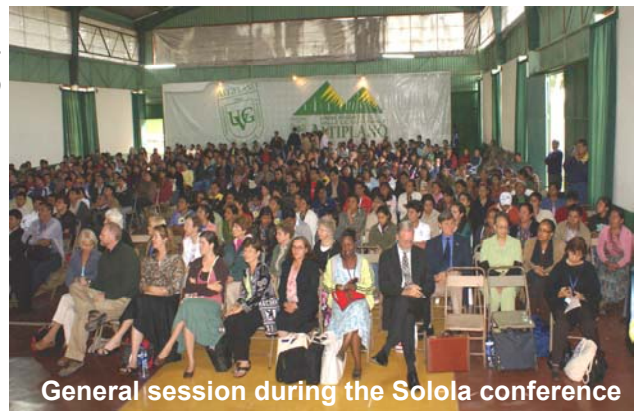
General session during the Solola conference

After watching the Jesus Film , one man said he felt shocked! He hadn't realized how Jesus lived—how He loved people and did such good, and set an example to all around Him regarding right and wrong. This man said, "I now feel motivated to do the same with my life."