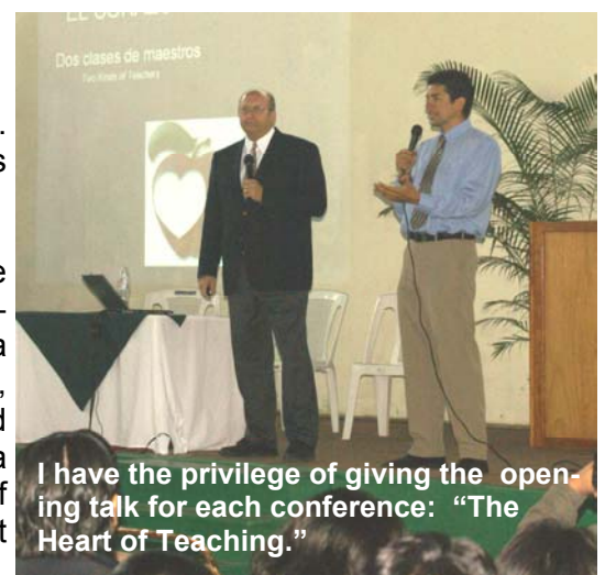
I have the privilege of giving the opening talk for each conference: "The Heart of Teaching."